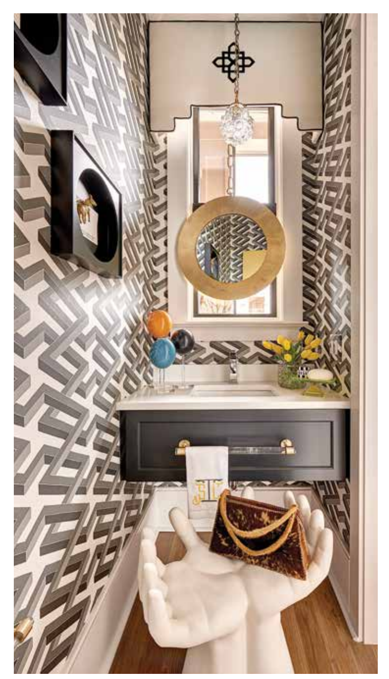
Above: The gold-toned mirror by Arteriors punctuates the black-and-white geometric wallpaper by Cole & Son. Right: Kitchen porch furnishings feature sleek, contemporary lines with coordinating throw pillows in bold prints by Cotton and Quill. (All items available through designer STI).